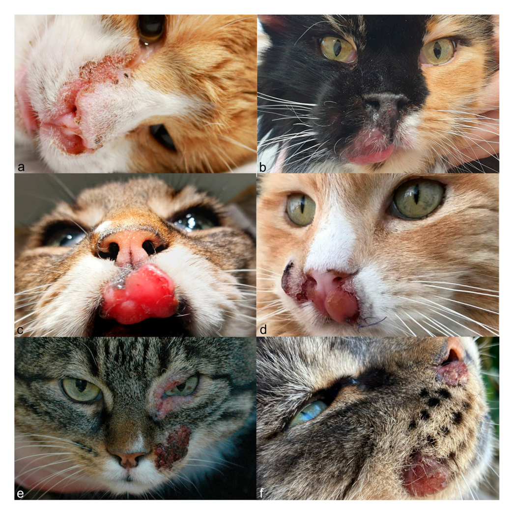
Figure 1. Clinical features of cats with facial spindle cell tumors. Poorly demarcated lesion with crusts, erosions, and ulcerations in cat 1 (a). A single mass in cat 2, which has evolved from erythema and erosion (b), and cat 8 (c). Masses that have evolved from ulcerations and crusts in cat 3 (d). A plaque (periocular) and mass (left cheek) in cat 12 (the third tumor in the left upper lip of this cat is not shown) (e). Two plaques in cat 20 (f). The plaque on the upper lip evolved later into a big mass.

(Figure 3). Ten of the grade 1 tumors (37%) and two of the grade 2 tumors (40%) were histopathologically diagnosed or presumed to be feline sarcoids based on the intimal association of the tumor with the overlying epidermis and the prominent epidermal hyperplasia with the formation of long rete ridges. The other grade 1 and grade 2 tumors were diagnosed as STSs. Two tumors (5.9%) in the study presented moderate to high anisocytosis and anisokaryosis, a high number of mitoses (more than 20 mitoses in a tumor area of 2.37 mm²), and areas of tumor necrosis and were diagnosed as grade 3 STS with amelanotic melanoma as a differential diagnosis (Figure 3).